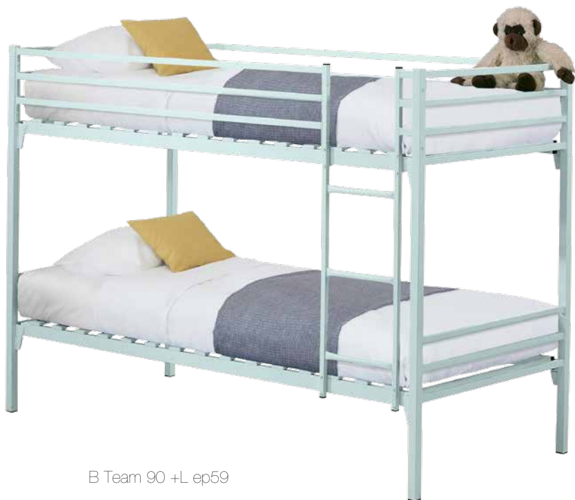
B Team 90 +L ep59